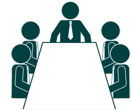
Meetings & presentations